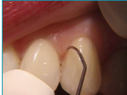
Removing plaque below the gumline