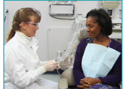
An excellent resource