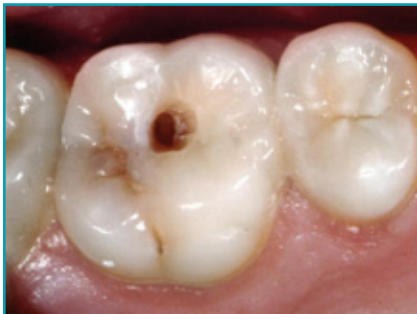
A visible cavity

Almost all water naturally contains some fluoride. About two-thirds of American cities add additional fluoride to the water supply for the prevention of tooth decay. In fact, fluoridation of public water systems can reduce cavities in baby teeth by 60 percent and those in permanent teeth by 35 percent.